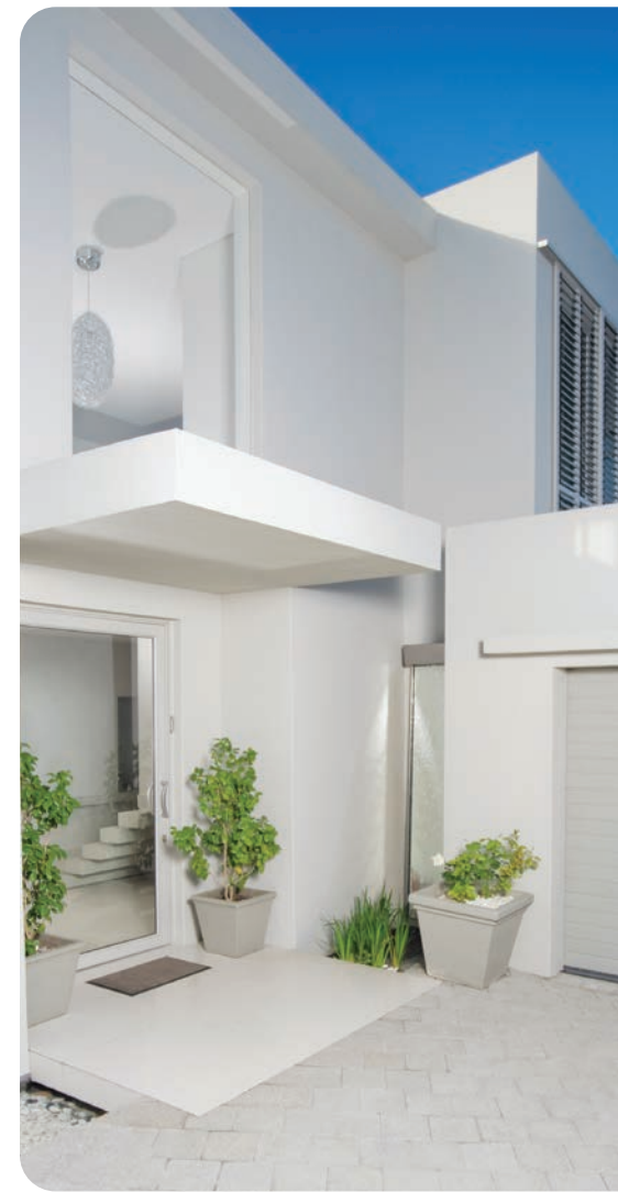
Walls: Cool December (DEW383)