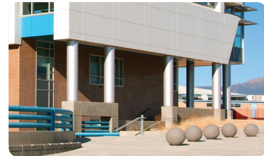
Body: Warm White (DEW380) • Metal Work: Oasis (DET546)