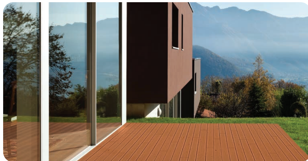
Deck: Fireside Chat (DESS05)