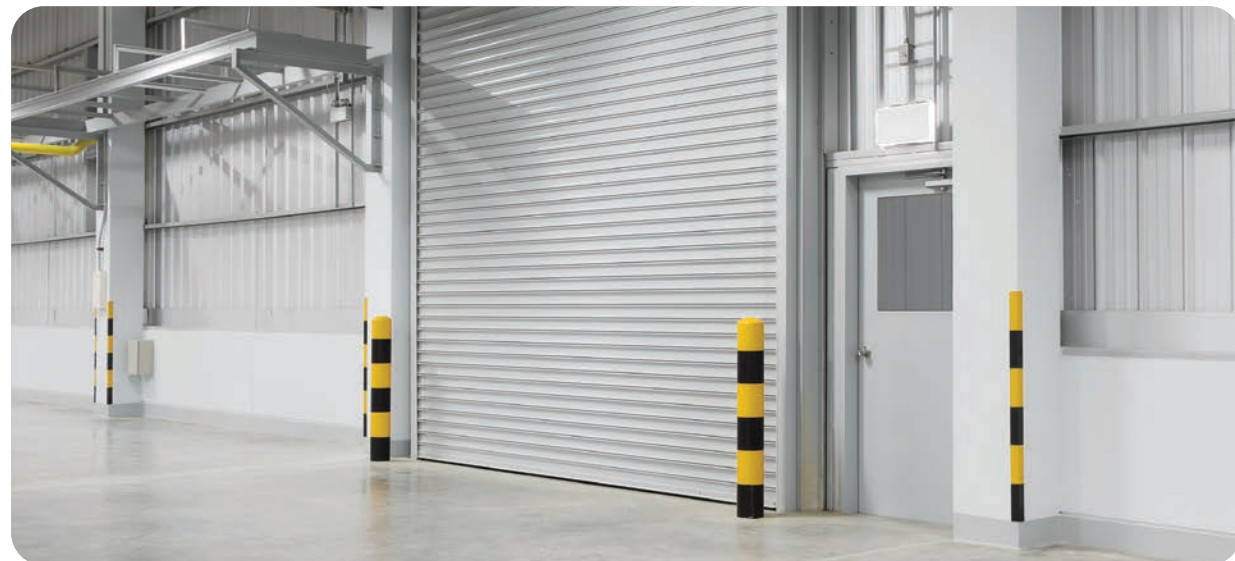
Metal + Trim: Silver Spoon (DE6366) • Walls + Pillars: Igloo (DEW379)